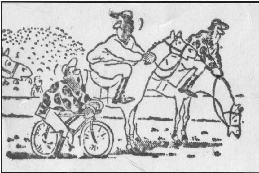
'My bike's greener than your horse'